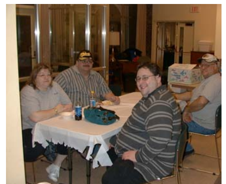
GPASI Members enjoying the Holiday Party