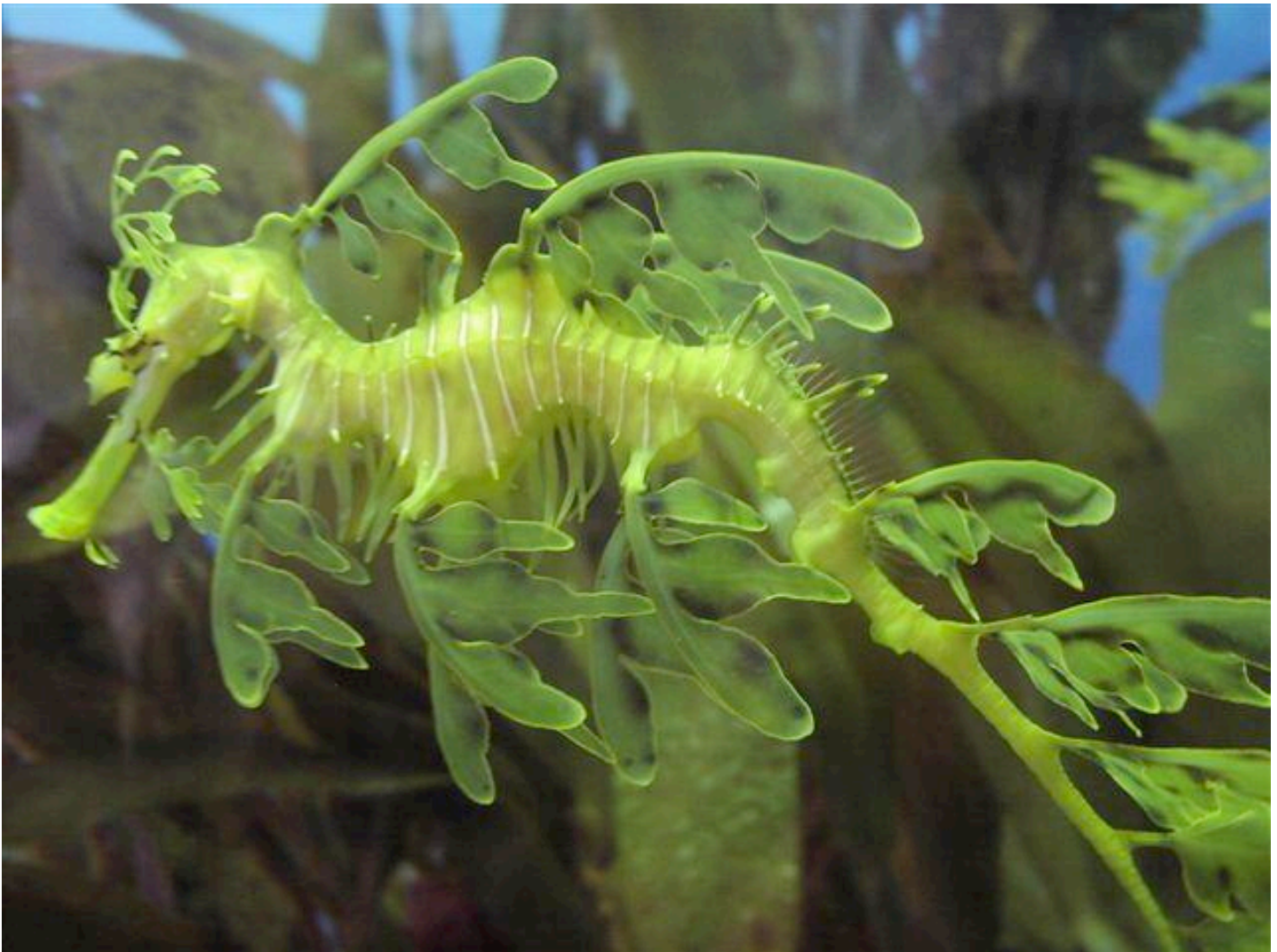
Leafy sea dragon at the PPG Aquarium